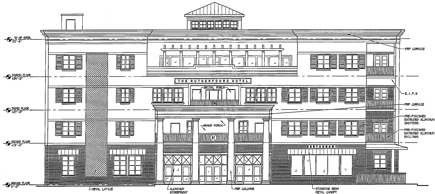
1 A2.1 1/8"=1'-0" SOUTH ELEVATION