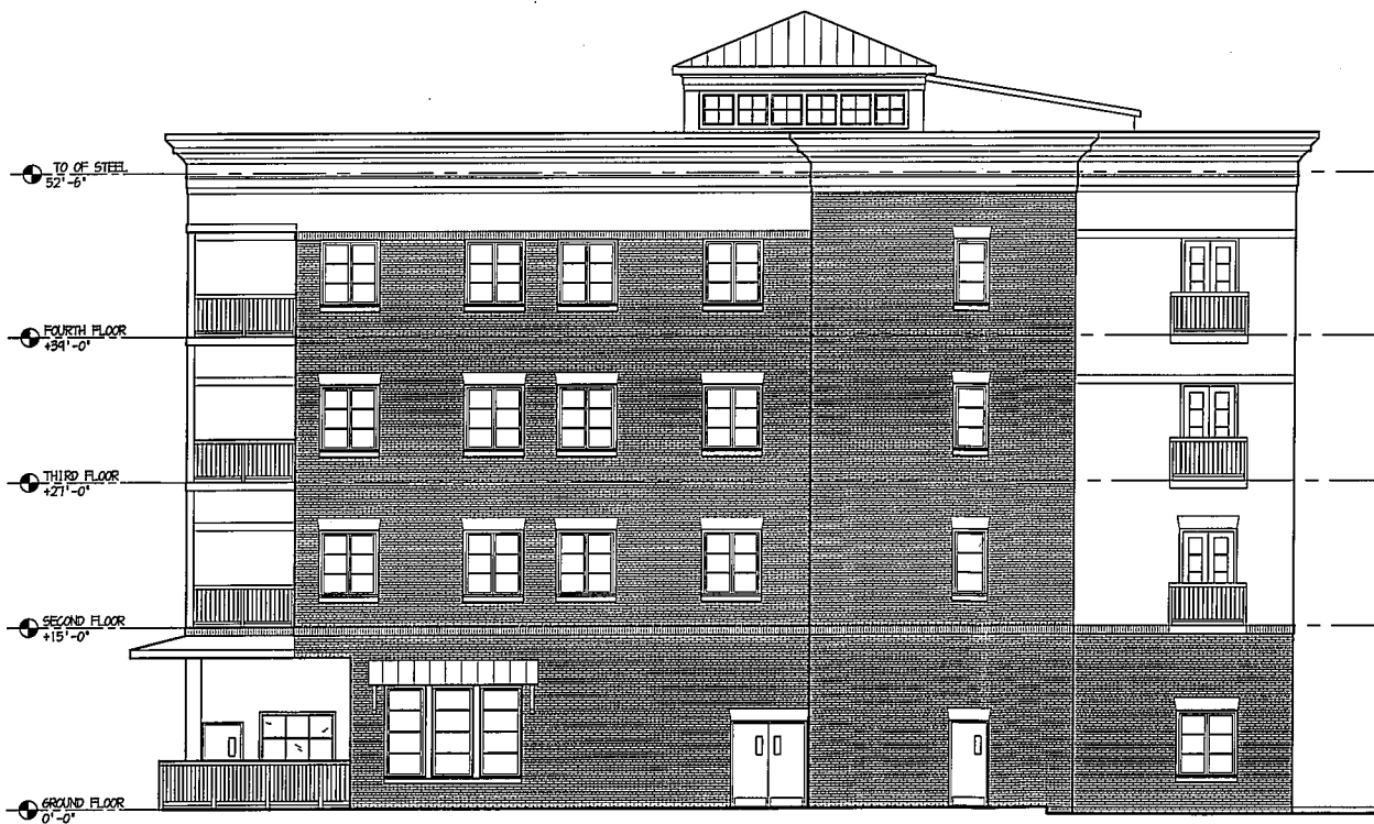
2 A2.1 1/8"=1'-0" WEST ELEVATION