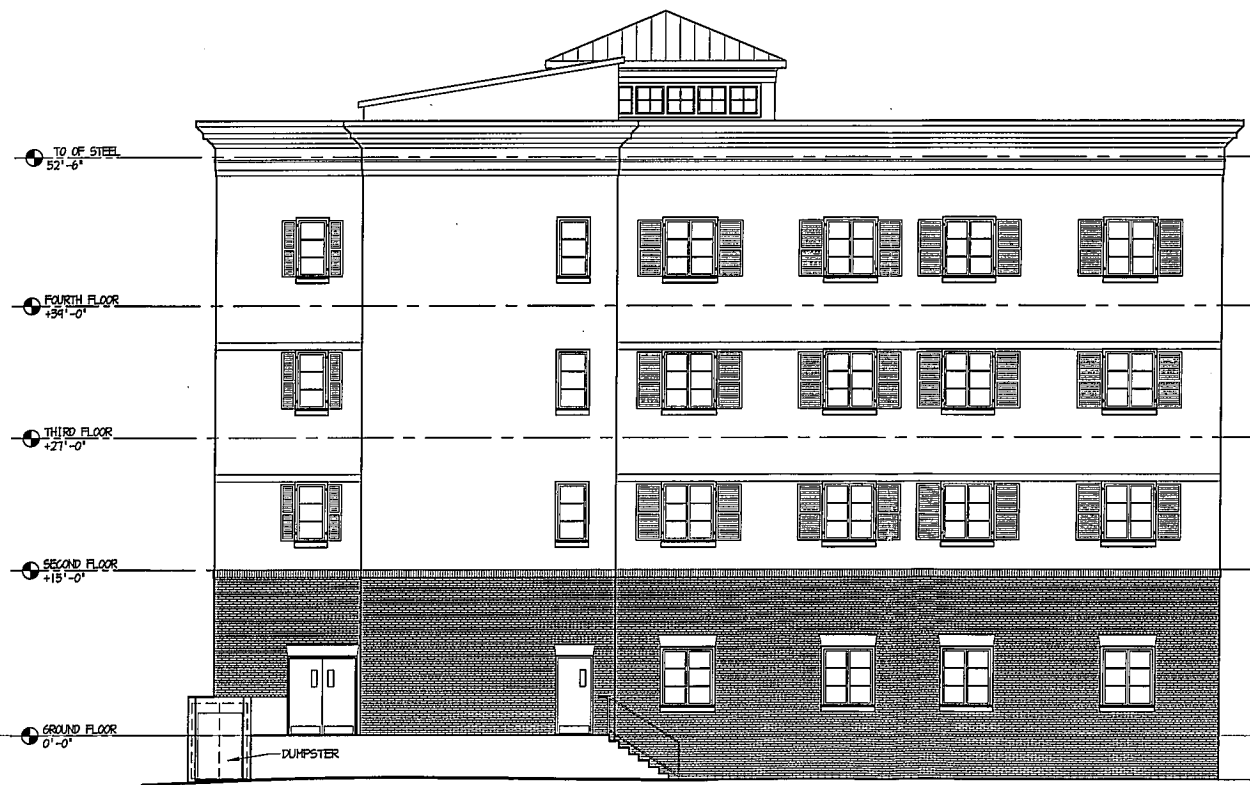
2 EAST ELEVATION A2.2 1/8"=1'-0"