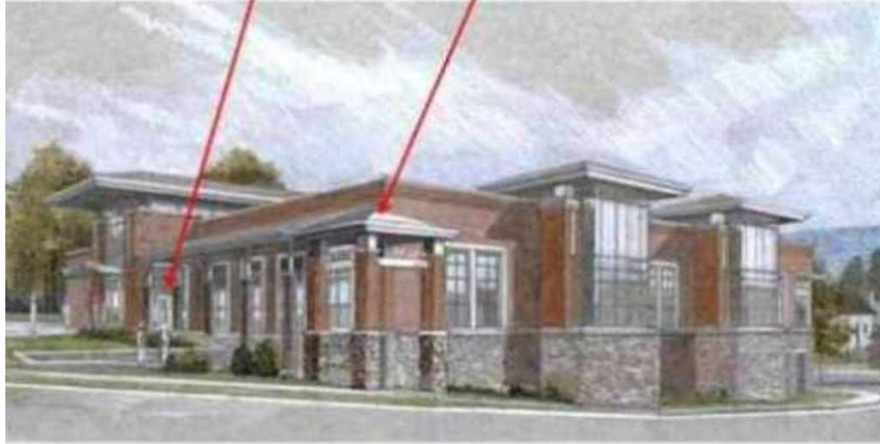
Crozet Library view along Main Street

This is what the library's main entrance will look like from Main Street