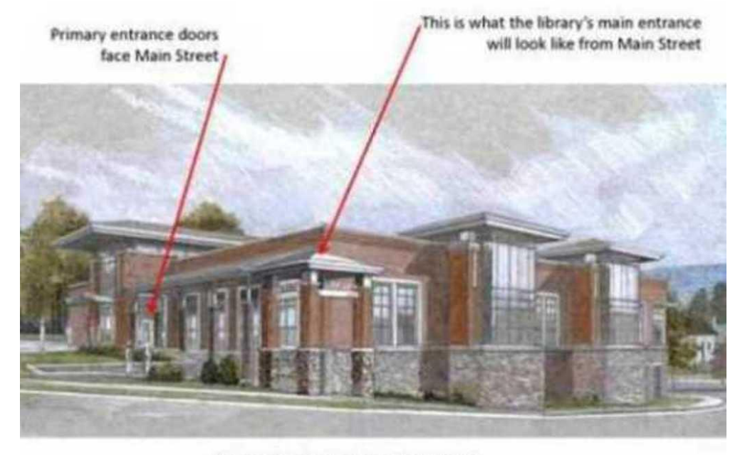
Crozet Library view along Main Street